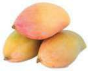
Totapuri Mango Min 14°Bx Min 28°Bx