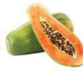
Red Papaya Min 9°Bx Min 25°Bx