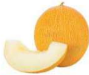
Honeydew Cantaloupe ▶ DICED ▶ BALLS