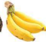
Banana Min 20°Bx Min 30°Bx