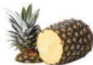
Pineapple ▶ DICED