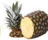
Pineapple Min 10°Bx Min 60°Bx