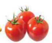
Tomato Paste Min 28°Bx