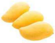
Alphonso Mango Min 16°Bx