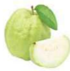
White Guava Min 9°Bx Min 20°Bx