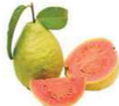
Pink Guava Min 8°Bx Min 18°Bx