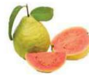
Guava ▶ DICED