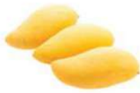
Alphonso Mango ▶ SLICES ▶ DICED