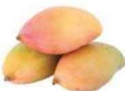
Totapuri Mango ▶ SLICES ▶ DICED